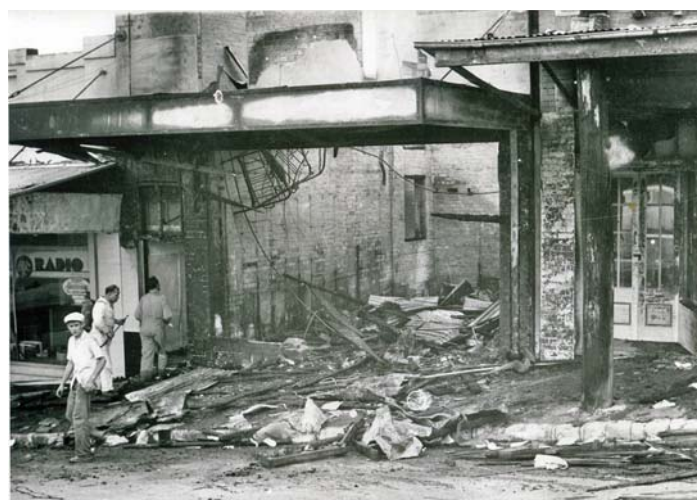
Burnt out shops in Leura Mall

By the way, mention was made of the Chateau Napier. It was considered the grandest guesthouse in Leura and was linked to tourism in the Blue Mountains during the early 20th Century. The rough cast archway at the top of Leura Mall (Chateau Terrace) and the large sandstone retaining wall along the highway are the only remains left. Proposals to develop the site are ongoing.