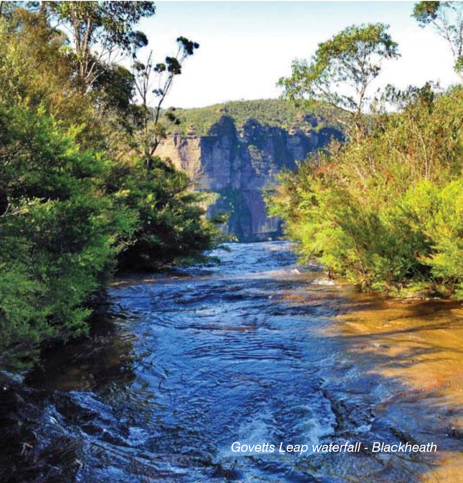
Govetts Leap waterfall - Blackheath