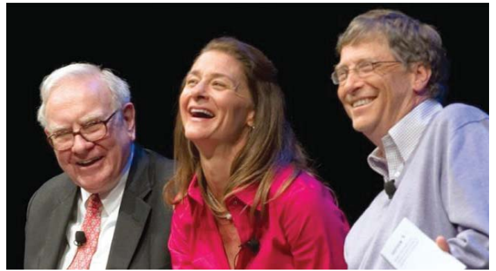
Warren Buffett, Melinda and Bill Gates

Warren, when you announced your gift to our foundation, you told us to make big bets. The whole world is making