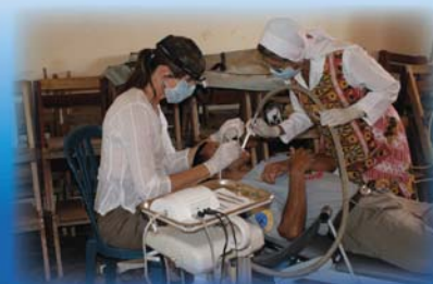
Funding medical and dental programs