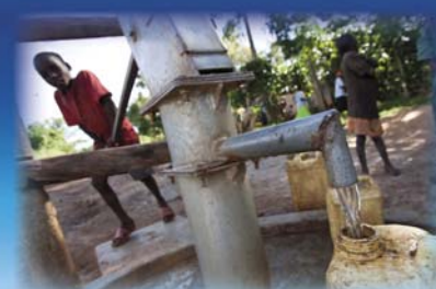
Providing clean water