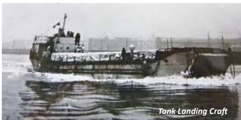
Tank Landing Craft

They were once secret vessels. No official photographs were ever taken as they were the first of their kind.