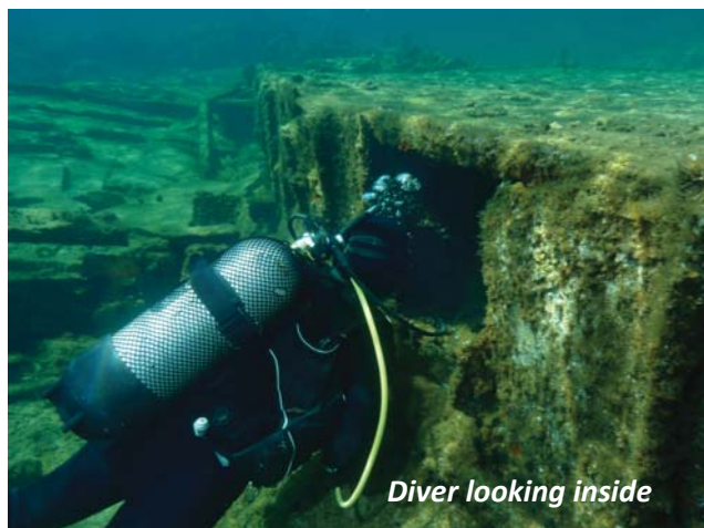
Diver looking inside