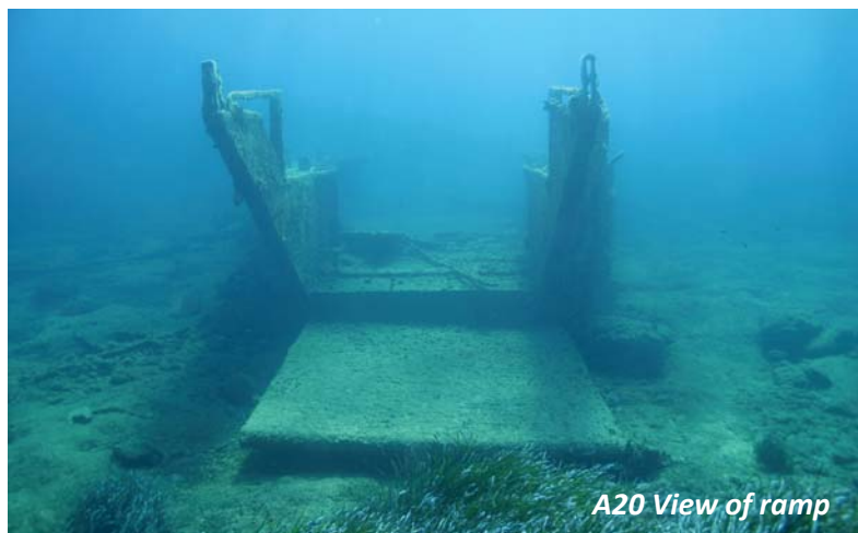
A20 View of ramp

Each LCT craft carried up to 900 soldiers (more than double a normal passenger load) from Greece to Souda Bay in Crete in April 1941.