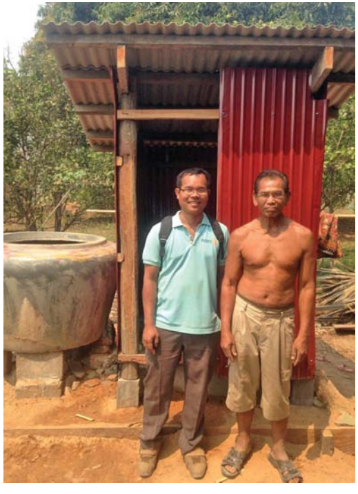
Families receive latrine in Cherng Plerng and Andong Sambour Villages