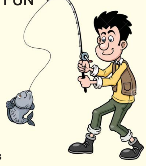
Fishing licence NOT REQUIRED for this event

FISHING COMPETITION WITH GREAT PRIZES Register from 9.00am - Child 12 and under $10 13 to 17 years $15 - Adult $20 Buy a Family Pass One adult and three children - just $40