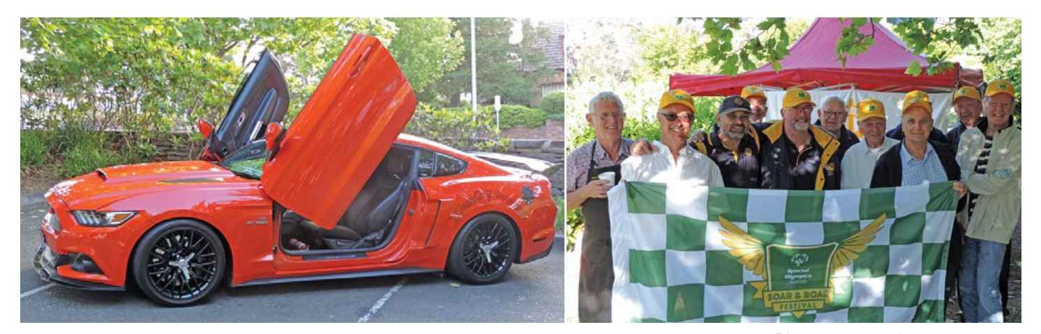
Please turn to the next page