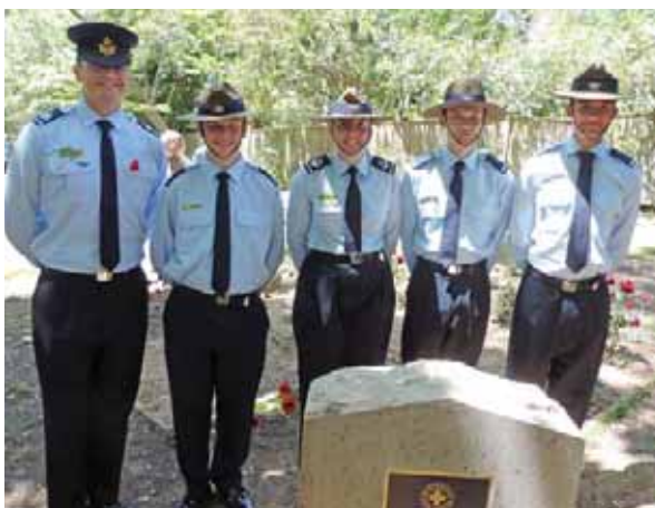
Australian Air Force Cadets attended the dedication of the Red Cross Rose Garden and the unveiling of a plaque to commemorate the service of 27 women from the Blue Mountains who served in WW1 and three who did not return.