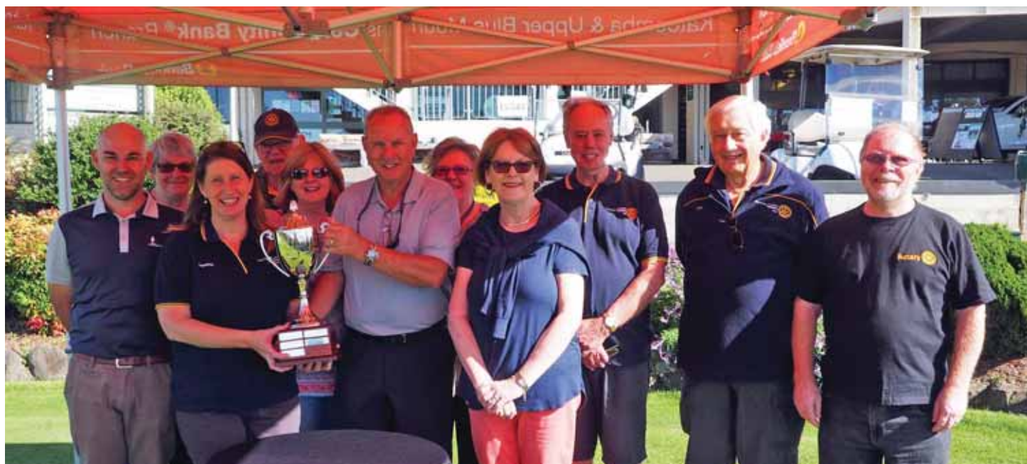
Central Blue Mountains Rotary and Greystanes volunteers: Central Blue members provided breakfast for 80 golfers and volunteers. NSW Governor David Hurley started the day by hitting a great shot from the first tee. Money raised will be used to purchase a much needed vehicle from Blue Mountains Mazda, to transport clients to medical appointments.