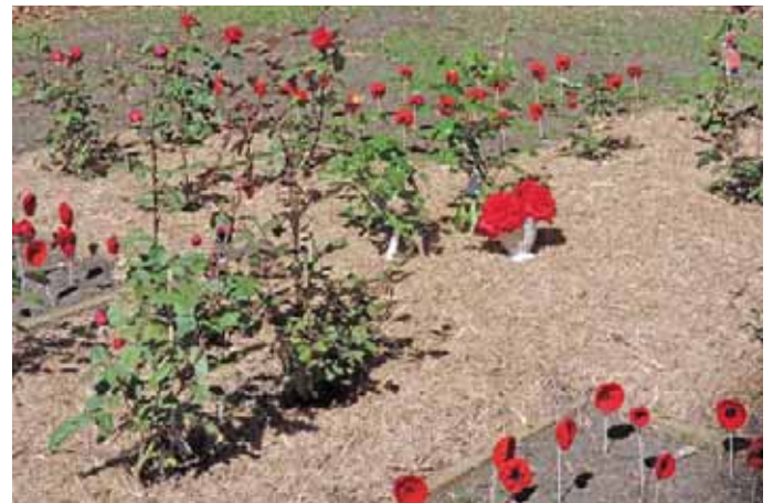
The newly dedicated Red Cross Rose Garden