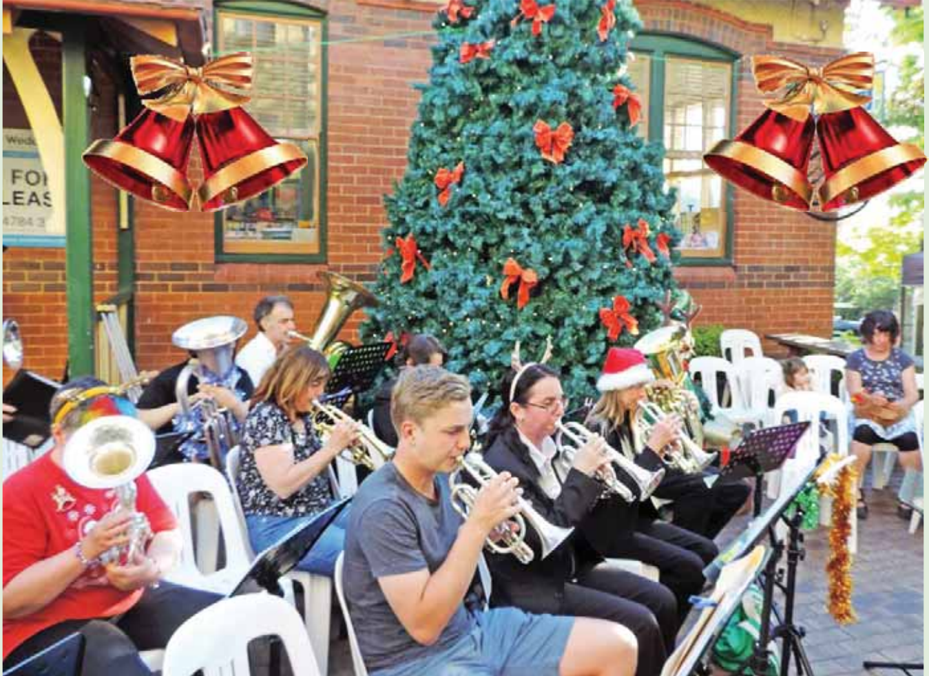
Katoomba RSL Blue Mountains City Band