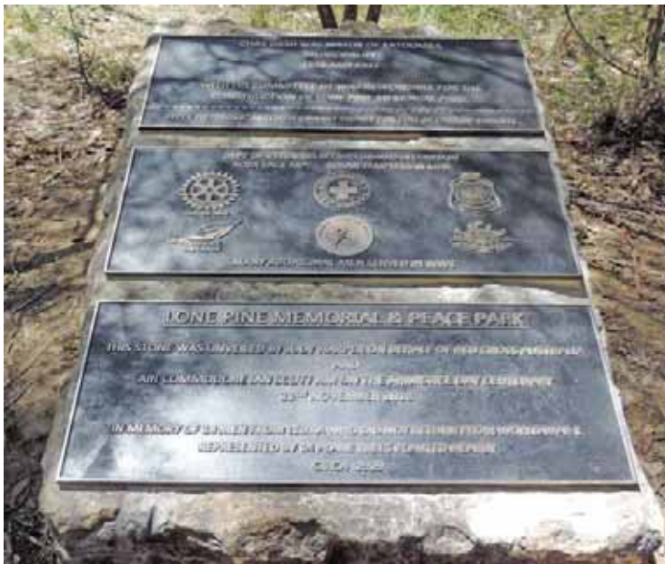
Plaque unveiled in memory of 14 men from Leura who enlisted in World War 1 and did not return.