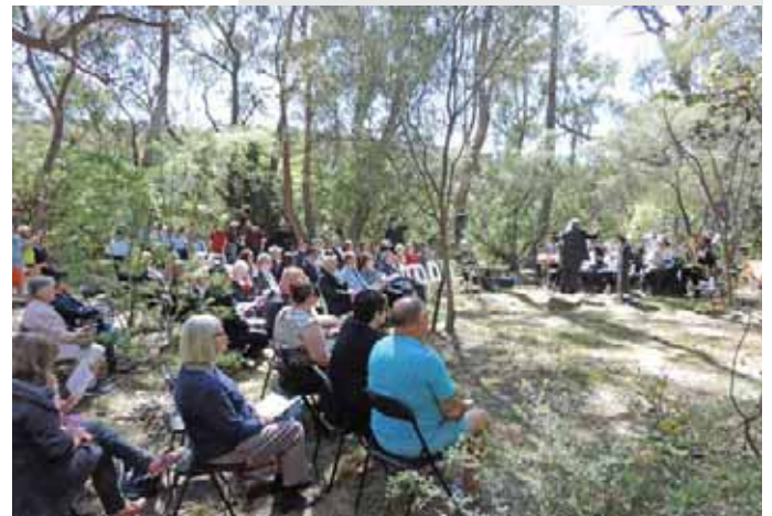
A magnificent bush setting for the Remembrance Ceremony