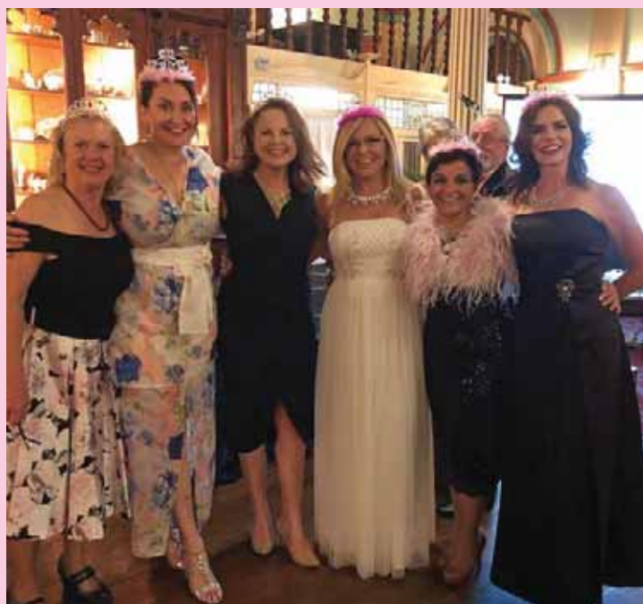
Pink Ball Princesses