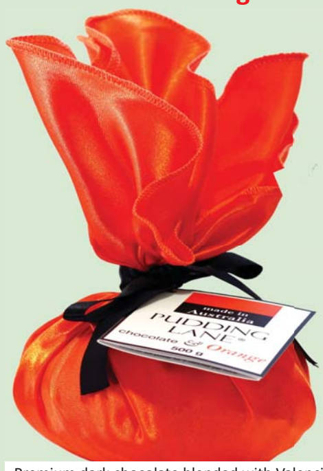
Premium dark chocolate blended with Valencia Orange tastes, fruit and French Orange Liqueur

Pudding Lane Christmas Cakes and Puddings