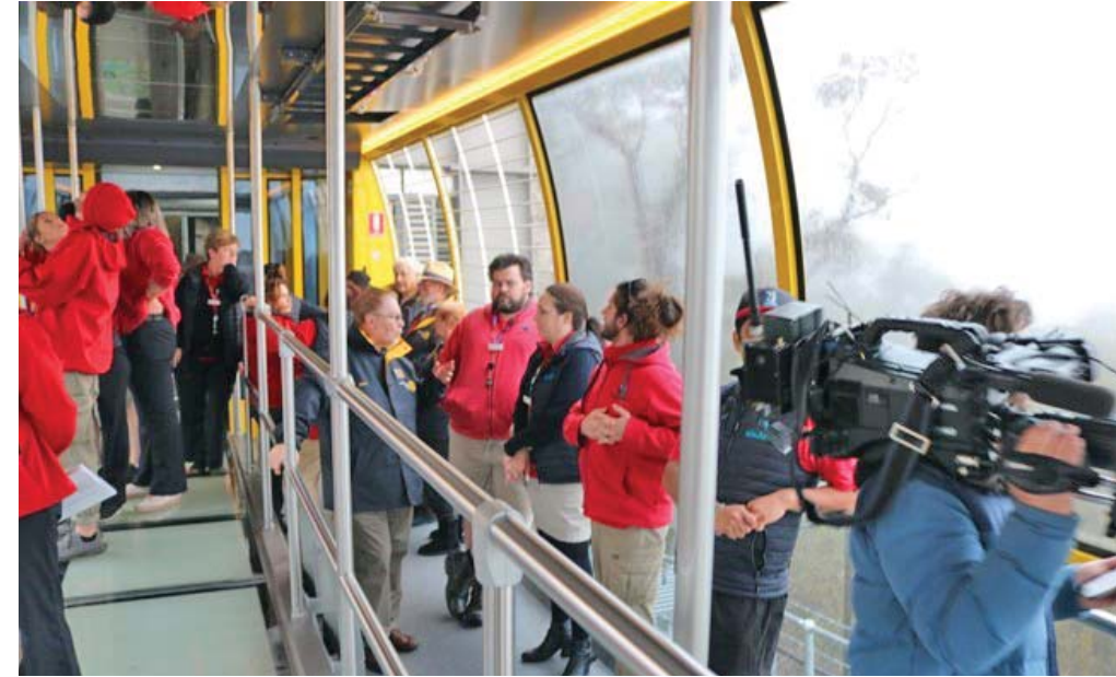
Here we are riding on the new Skyway - not much to see through the heavy mist.