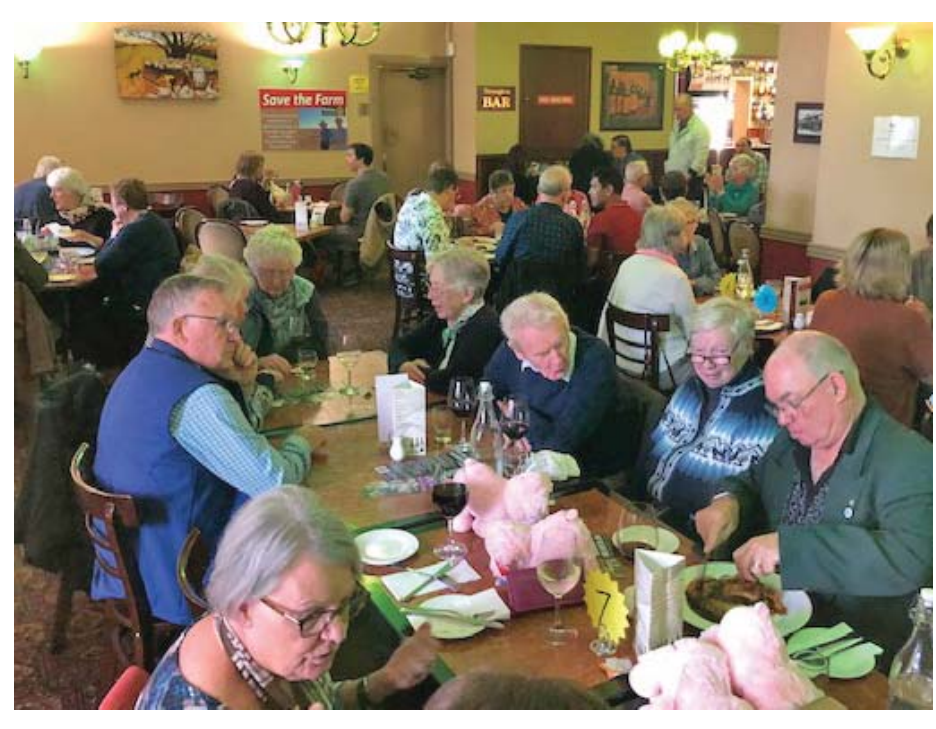
Please turn to the next page