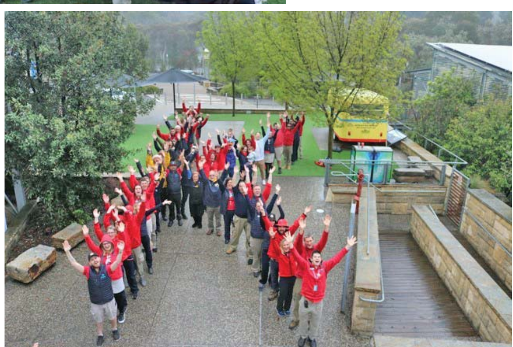
How about this!...we formed a BIG K to promote Katoomba