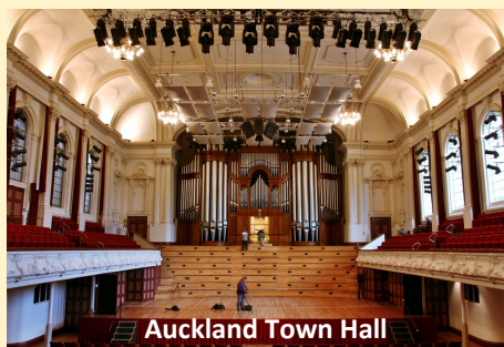
Auckland Town Hall