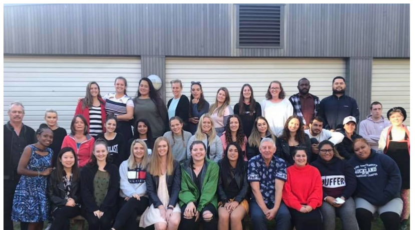
District 9910, RYLA GROUP 2019

"Be Accountable, Be Brave, Recognise Your Values"