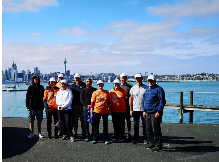
After almost 15,000 participants and constant clapping - all done and dusted by 10:15am