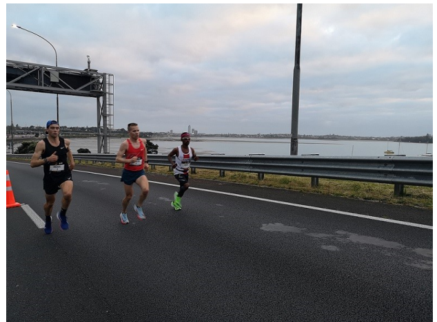
The first marathoners at 06:50am. The guy on the far right (white singlet) was the eventual winner in 02:19:33