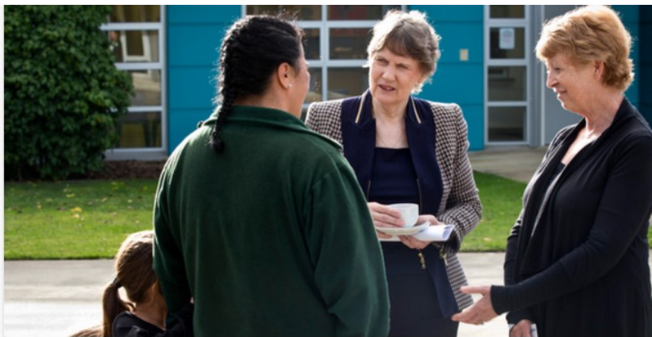
Former PM Helen Clark attends Literacy Programme award ceremony.