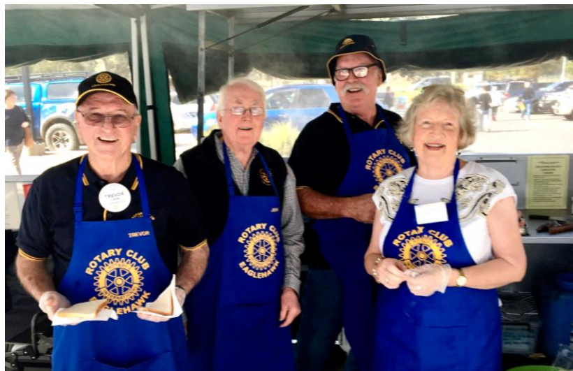
The Bunnings BBQ - Saturday 17 th April – great weather for a sausage!