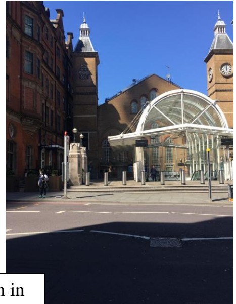
Photos of London in Lockdown