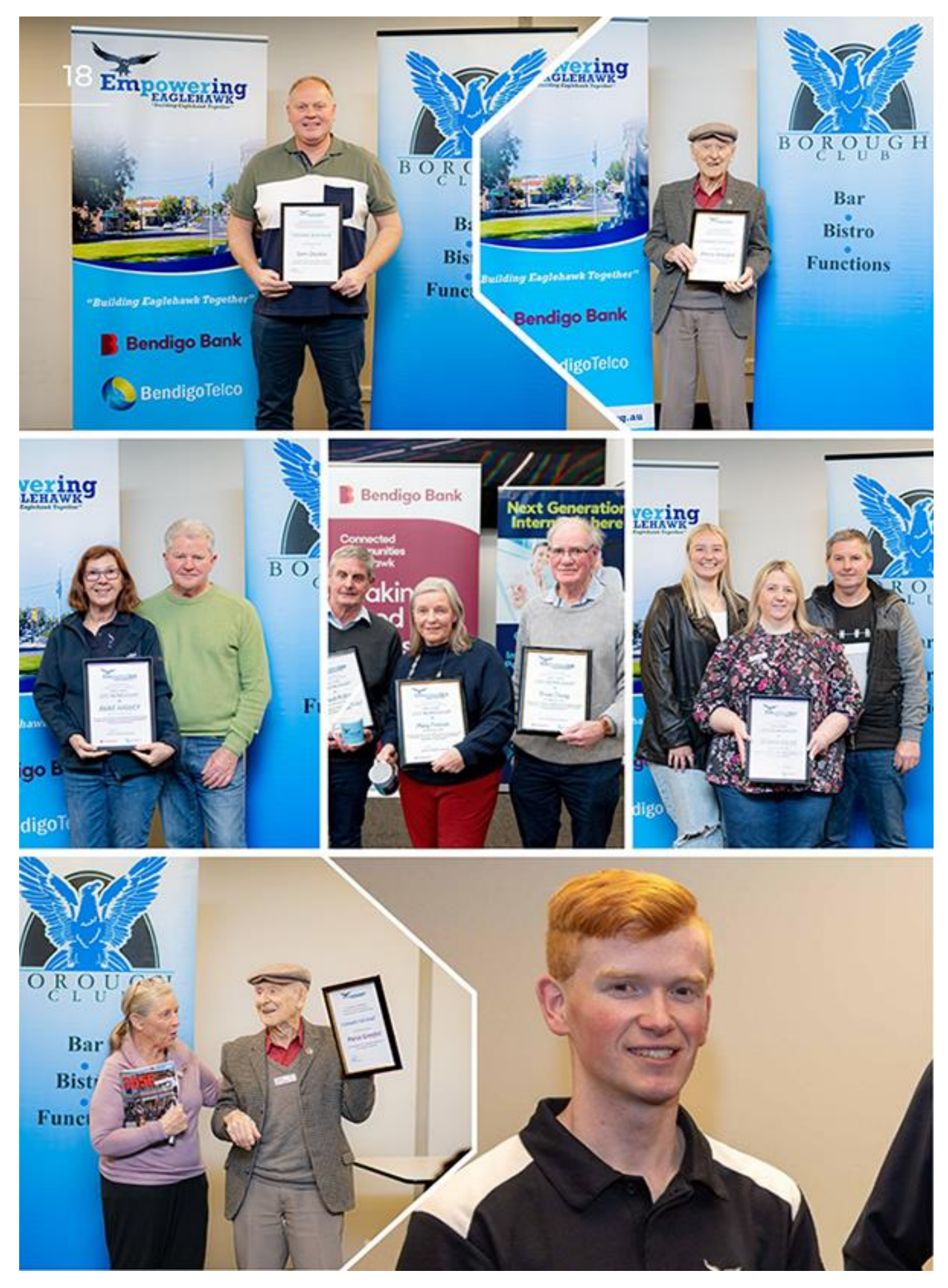
More photos from the Empowering Eaglehawk Annual Celebration evening