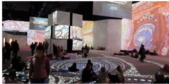
Vic Market, trams, Immigration Museum and First Nations exhibition at the Lume