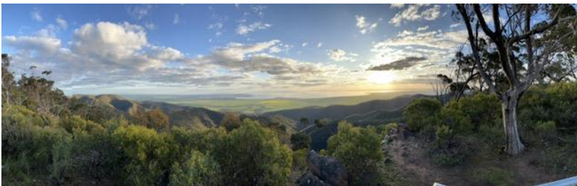
The Bluff – Melrose SA