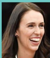
Jacinda Ardern Prime Minister New Zealand