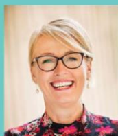
Sally Capp Lord Mayor City of Melbourne