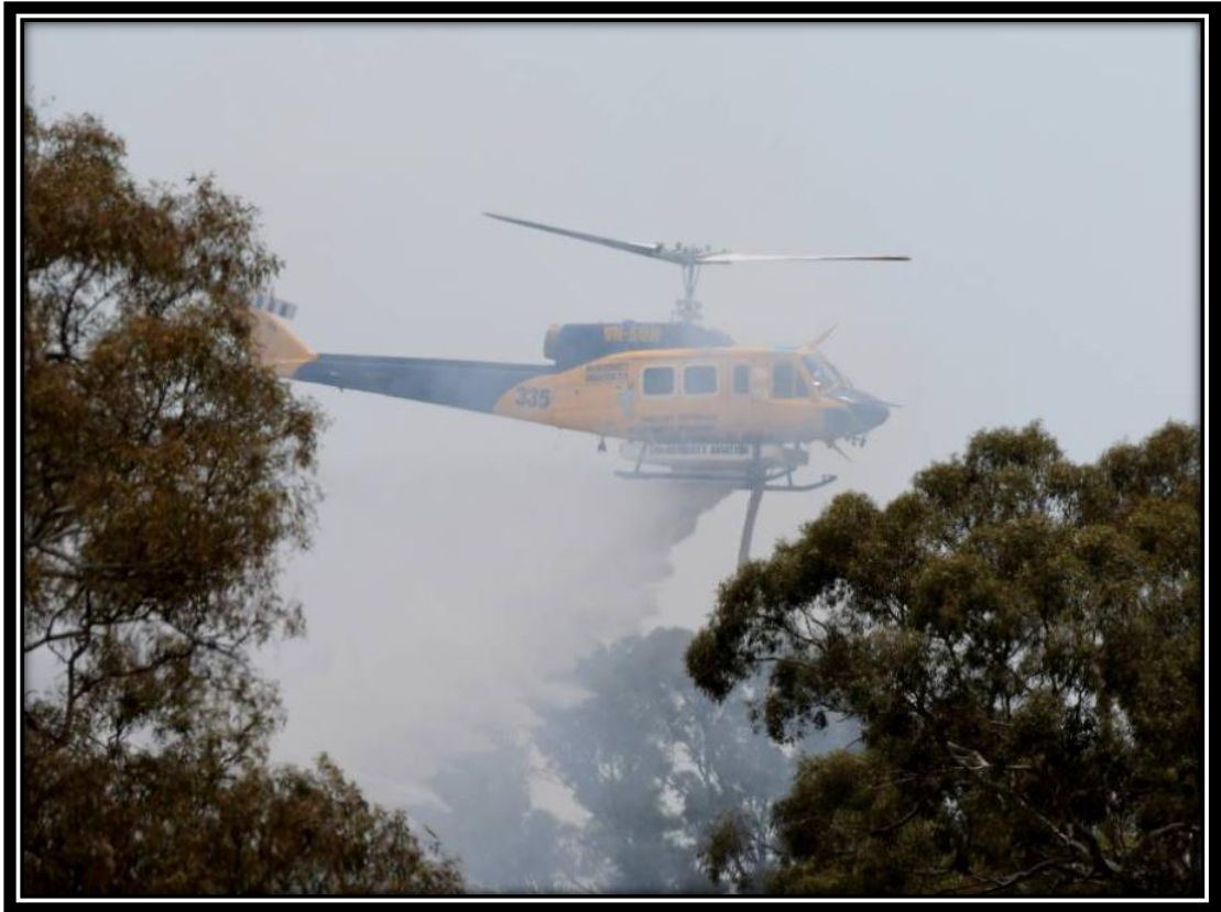
Bendigo Based Bomber 335 working at Baringhup fire on Thursday 09.02.2023