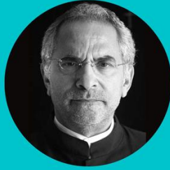
JOSÉ RAMOS-HORTA AC Nobel Laureate, Former President of East Timor