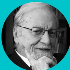
THE HON GARETH EVANS AC Former Politician & Academic