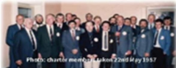
Photo: charter members taken 22nd May 1957

Rotary Woodend members - past and present - invite you to join us as we celebrate this auspicious occasion.