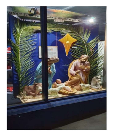
Scenes from last year's Nativity