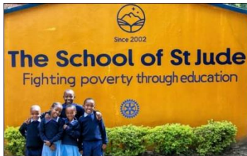
The School of St Jude