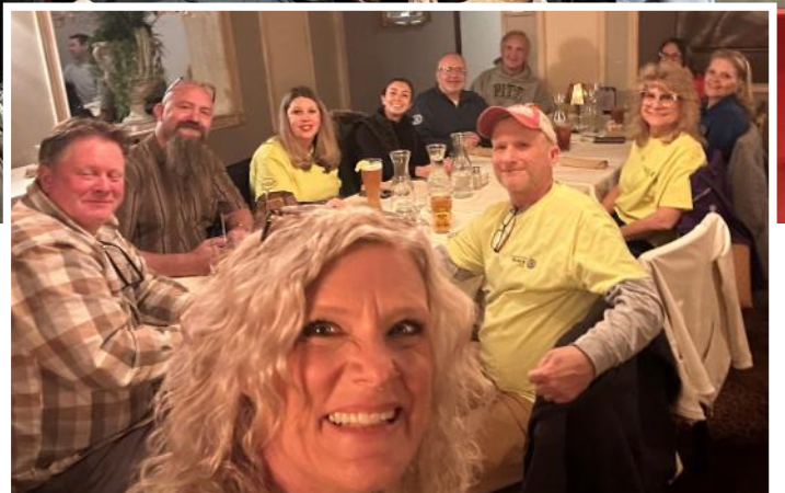
WINNER, WINNER, post-service dinner!

On March 18th the Rotary Clubs of Harrisburg and Elizabethtown met at the Central PA Food Bank to pack food boxes for those in need in Central PA. They also joined in a little friendly competition to see which club could pack the most boxes. Each club got 15 minutes on the clock to see what they could do. When the dust, tape & cardboard settled it was Harrisburg 88 and Elizabethtown 108. The two clubs then teamed up to complete a total of 320 boxes for the evening.