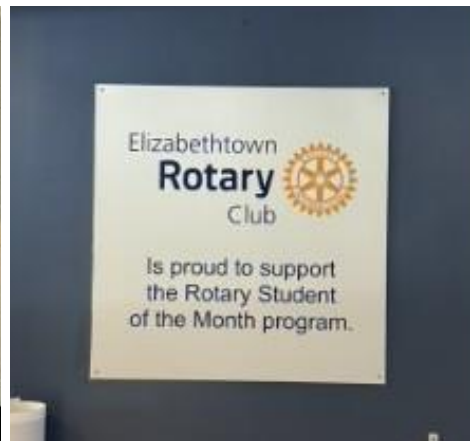
New signs at the Elizabethtown Middle School and High School