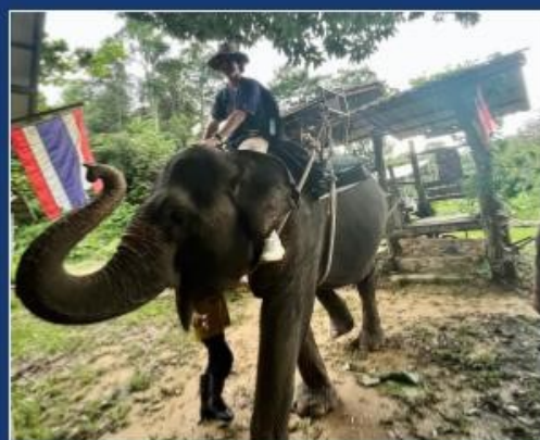
Geoff - Harrisburg - Thailand