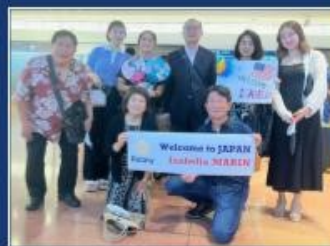
Isabella - Lititz - Japan