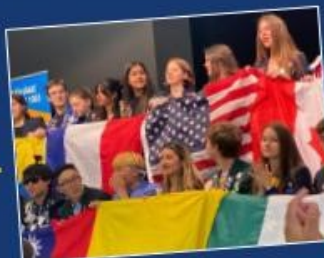
Gelisse - York - Slovakia

Open to all Rotarians, families & friends! Prospective Outbound applicants encouraged to attend! $10 admission - light snacks provided