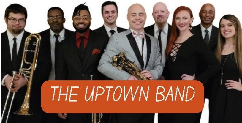
THE UPTOWN BAND