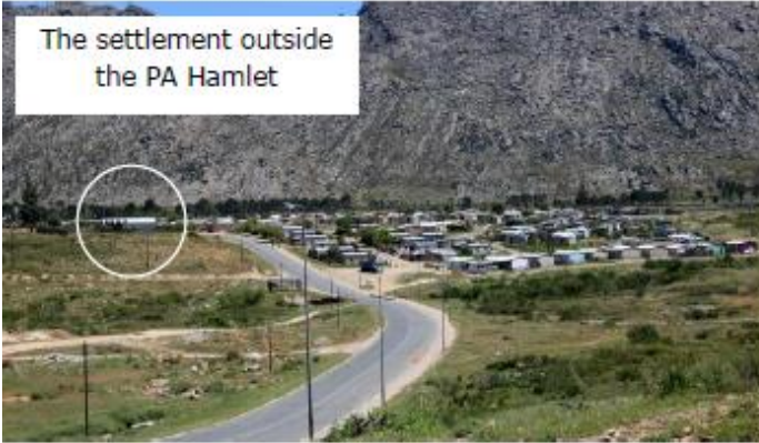
The settlement outside the PA Hamlet