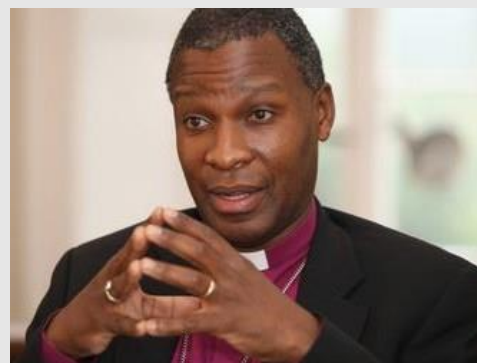
Archbishop Thabo Makgoba

“Yes, you heard me right. It’s time to stop marching, having discourses and debates, writing and repeatedly speaking about being anti-corruption. Why? Because it’s not about being anti-corruption... It’s about being pro-courage.”