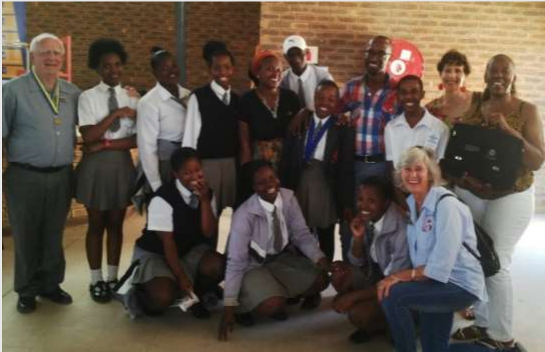
Interact Charter Ceremony held at Matthew Goniwe Memorial High