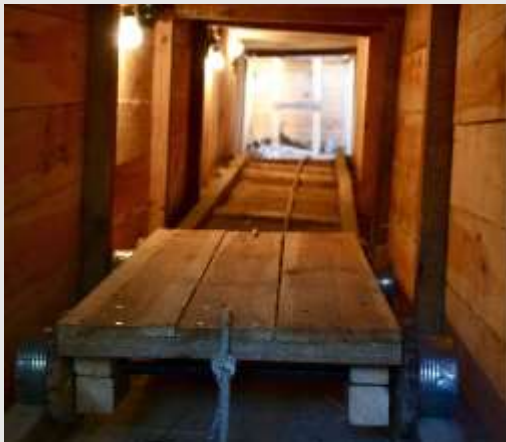
Tunnel vision: A tunnel reconstruction showing the trolley system.

were squirreled away by the Allied prisoners to aid the escape plan under the noses of their captors.