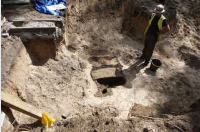
Unearthed: The entrance to the original 'Harry' tunnel, which lay untouched for almost seven decades.

Barely a third of the 200 prisoners many in fake German uniforms and civilian outfits and carrying false identity papers, who were meant to slip away managed to leave before the alarm was raised when escapee number 77 was spotted.