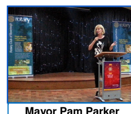
Mayor Pam Parker