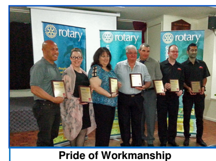
Pride of Workmanship

We experienced a wide range of guest speakers from representatives of local community groups, academics, young people