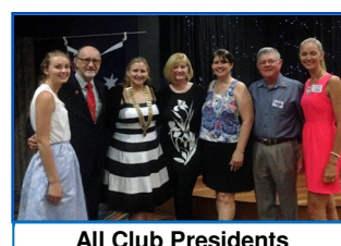
All Club Presidents