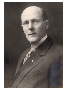
Paul Harris circa 1915.

"Personality has power to uplift, power to depress, power to curse, and power to bless."