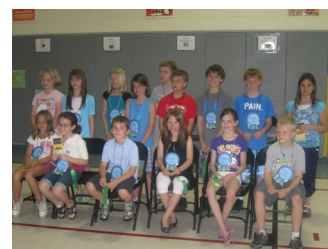
Contestants from the Pleasant Valley Elementary Spelling Bee.