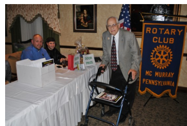
Manning the ever important front desk.