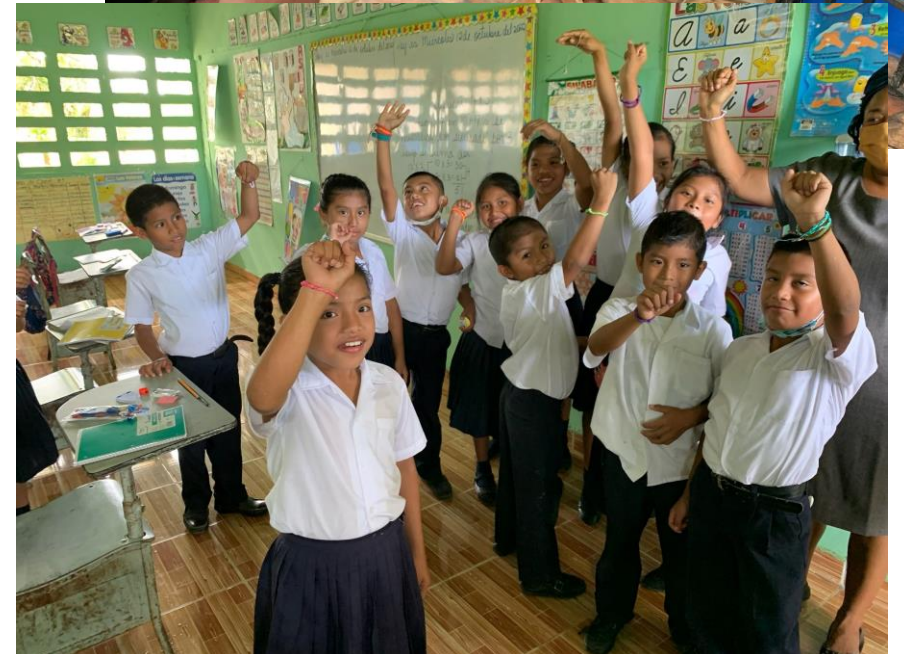
School Supplies & a game of Twister!