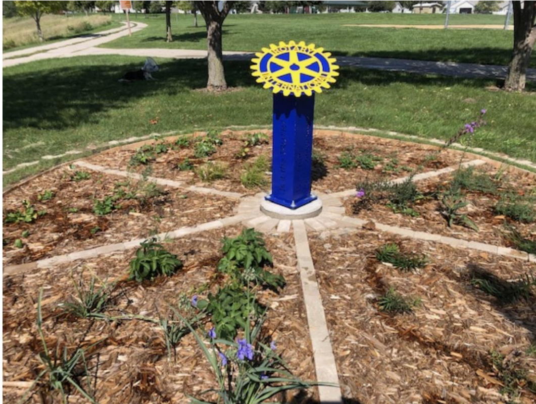
Greater Mankato Rotary Club Interpretive Pollinator Garden – August 19, 2023