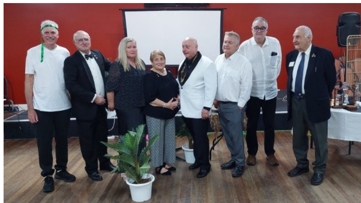
Most of the new Board for 2025-26