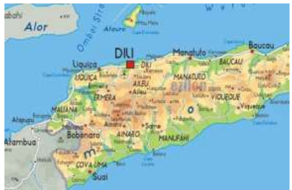
Natarbora – opposite to Dili