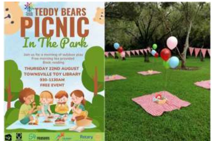
See the last page for a larger version with notes.