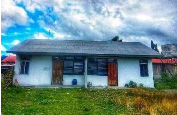
The house photo