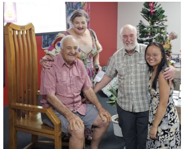
And the reason why