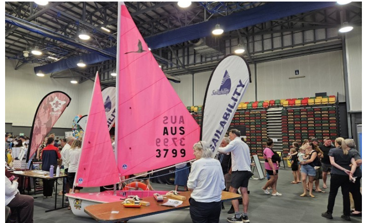
The Sailability stand, who are coming to talk to us