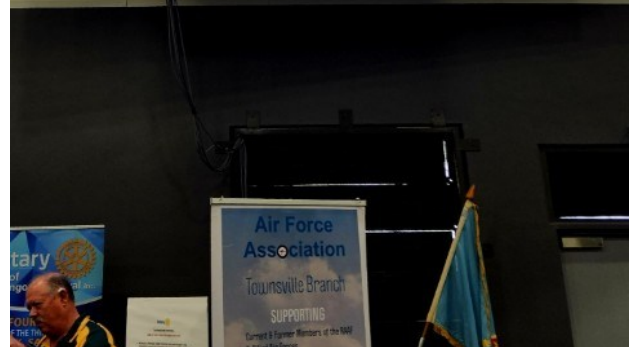
Part of our visual presentation to the room