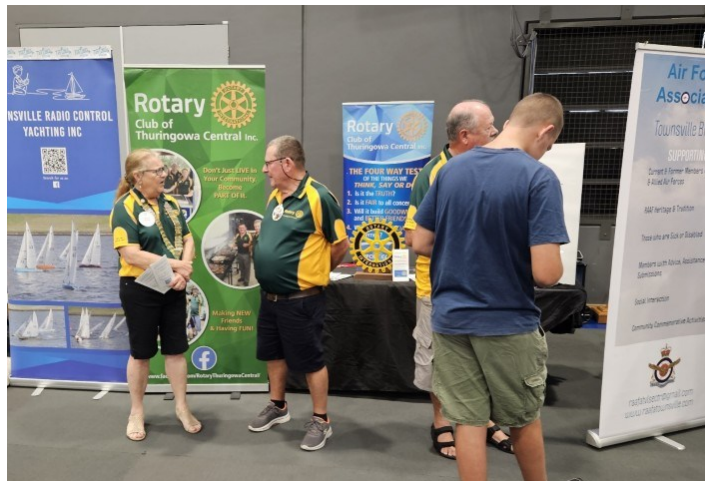
Rotary Thuringowa Central also attended