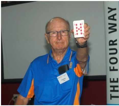
Jim Morrison – Wrong Card Jim