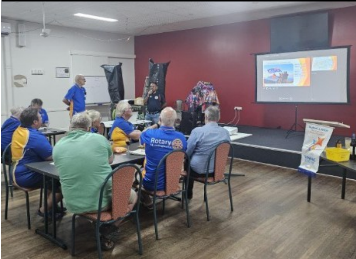
Some of the keen listeners

Rotary is also involved in other projects centred on clean water availability and education such as building classrooms and installing play-grounds.