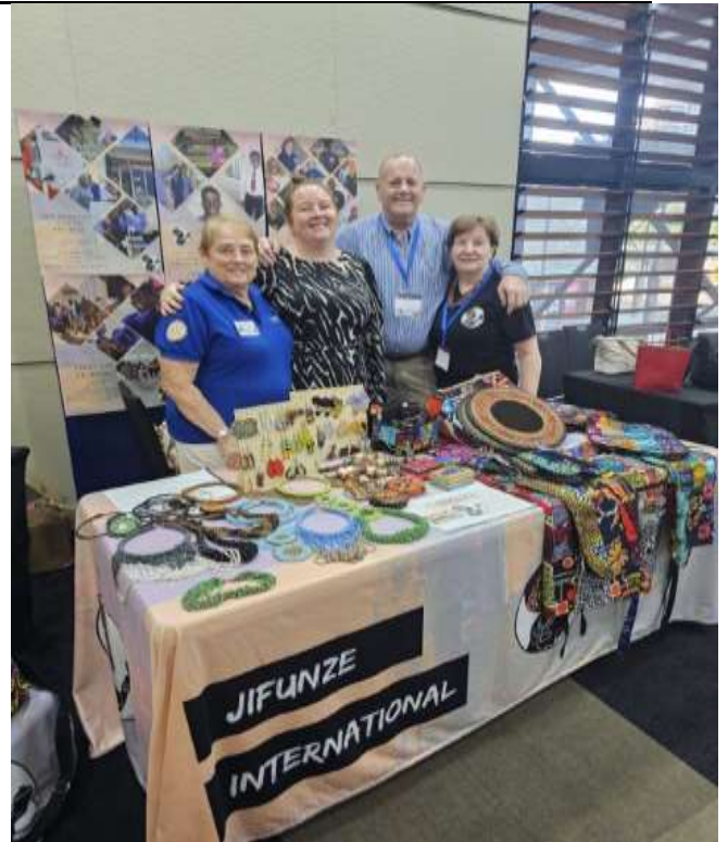
The Jifunze Team at the Conference.