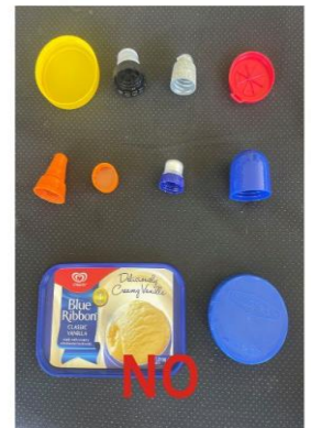
Recycle Codes 2 and 4. For milk tops remove insert and rinse.