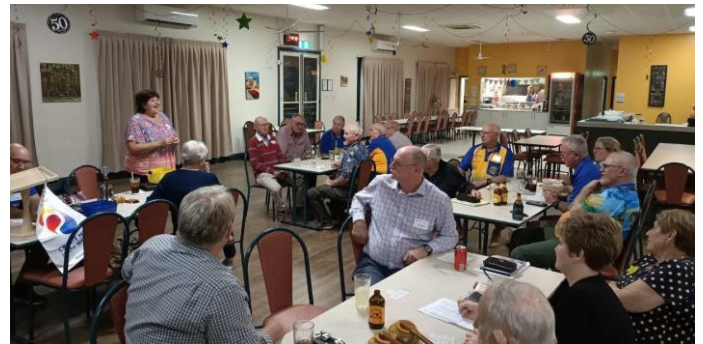
Lyn presenting to members