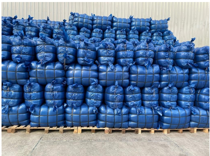
ShelterBox blankets in a warehouse in Poland