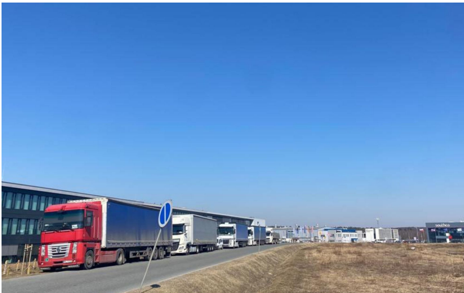
ShelterBox aid arriving in Poland

Our Club is funding 2 ShelterBoxes for $3,000. More information here and if members wish to make a personal donation, here .