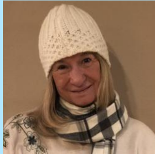
It's Getting Cold Out There