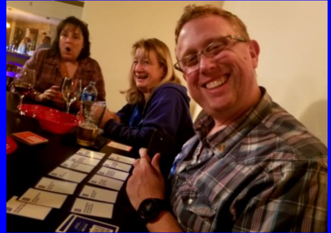
It's amazing what we learned about each other playing games at game night.