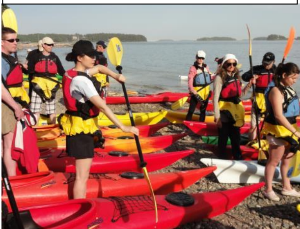
Kayaking on 13.6.2013 in Helsinki archipelago