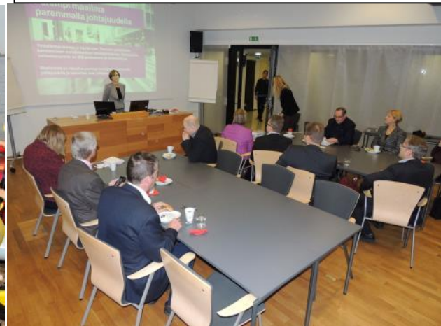
Terra meeting 3.12.2013 in Aalto University Executive Education unit.