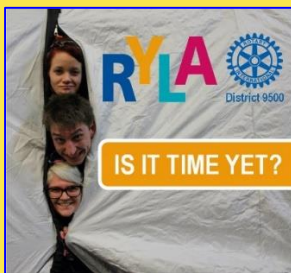
RYLA participants numbered over 30 for this camp from 16 th 22 nd April.

Looking forward to hearing from them when they have completed their stay at Nunyara