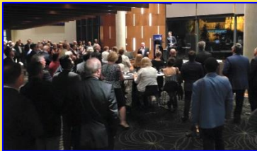
At the Rotary Club of Adelaide's Membership Information night at Adelaide Oval