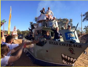
Battleship USS Navy