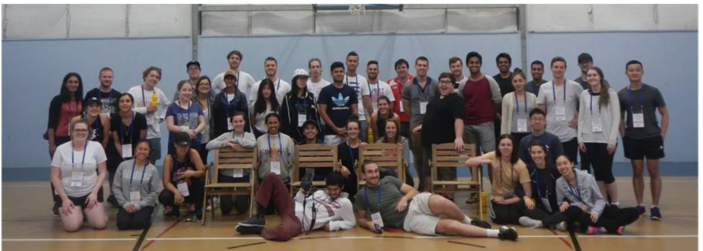
A team challenge - to construct IKEA chairs with limited instructions and no speaking!

The second day focused on learning about their own personality and style of leadership and how to work with other personalities and styles. Throughout the week they were provided with various challenges to push them to work in different groups of people and outside their comfort zone. One of these activities had them break into groups- each group was given a jumble of puzzle pieces from different puzzles. The aim was to try and complete a puzzle by negotiating to trade puzzle pieces with other groups. During this time there were a number of distractions- loud music, leaders asking them questions or asking them to take photos, yelling and general CHAOS! Leadership and problem-solving under pressure is an important skill that will serve them well for the rest of their lives. Each individual and each group found different strategies to deal with this and learnt that there are many approaches to each challenge but some are more effective than others.