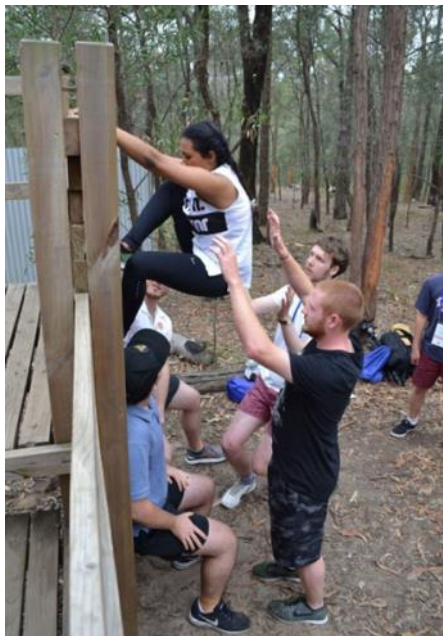
Teamwork in Action

Friday they heard from speakers who give excellent advice on approaches to life, getting out of your comfort zone and facing new challenges. In the evening it was time to let their hair down with a talent show that turned into a DANCE PARTY!