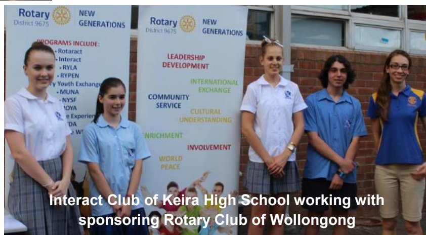
Interact Club of Keira High School working with sponsoring Rotary Club of Wollongong