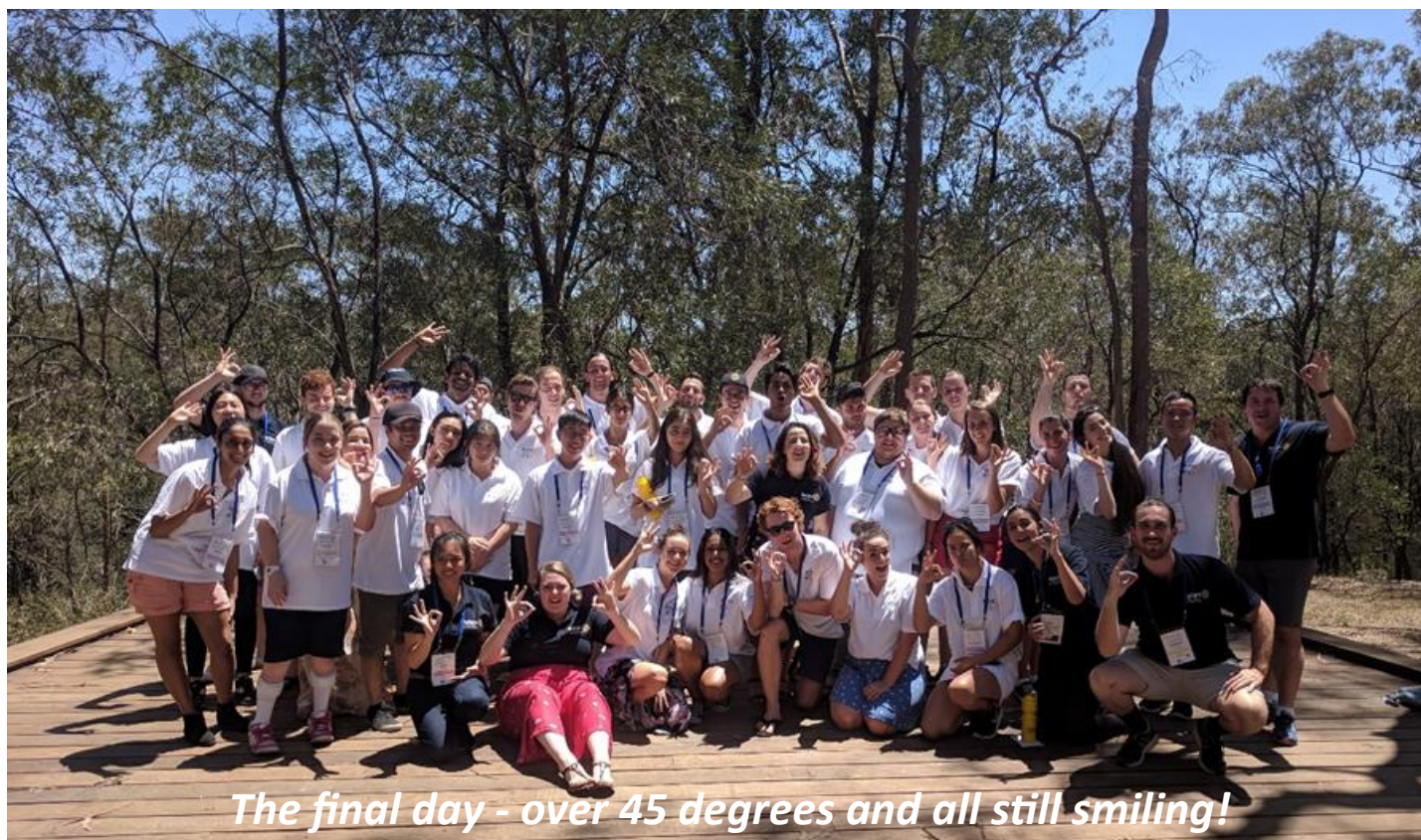
The final day - over 45 degrees and all still smiling!

The final day they heard from previous RYLarians about 'Life after RYLA'- a chance to get some perspective and consider how they can use their new skills out in the 'Real World'. We ended with a lunch attended by many Rotarians and a showcase from the week. The final goodbye was with a lot of hugs and a few tears- many saying they had developed stronger relationships in that 1 week than they had in all their previous years.