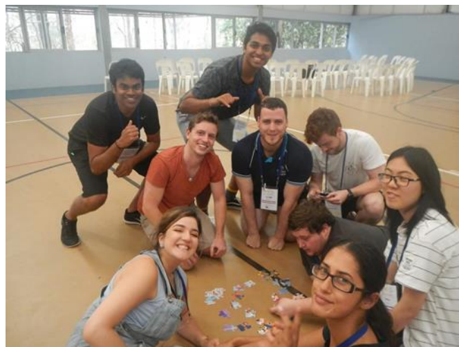
Trying to find the puzzle pieces with distractions

Saturday was the culmination of a lot of work throughout the week- RYLA Apprentice . Each team is given the opportunity to develop either a new program that fits within the Rotary goals or to change/enhance an existing Rotary program. On Saturday they presented these ideas to a panel of judges and were given feedback on them. This project allowed them to put into practice a number of skills they had developed during the week- project management, leadership, public speaking and most importantly- working within a team . It also allowed them to learn more about what Rotary does and to consider the opportunities to change the world that Rotary can offer them.