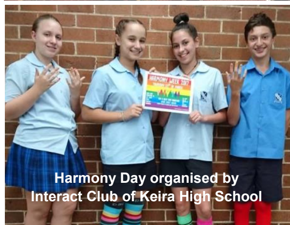
Harmony Day organised by Interact Club of Keira High School

Remember that it is important to have a Rotarian Mentor and Liaison Club member to provide the link between the school and the club.