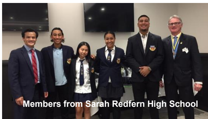
Members from Sarah Redfern High School

Interact Clubs are the responsibility of sponsoring Rotary Clubs who provide guidance and counselling and in the case of schools there is a strong relationship between the school and the sponsoring Club.