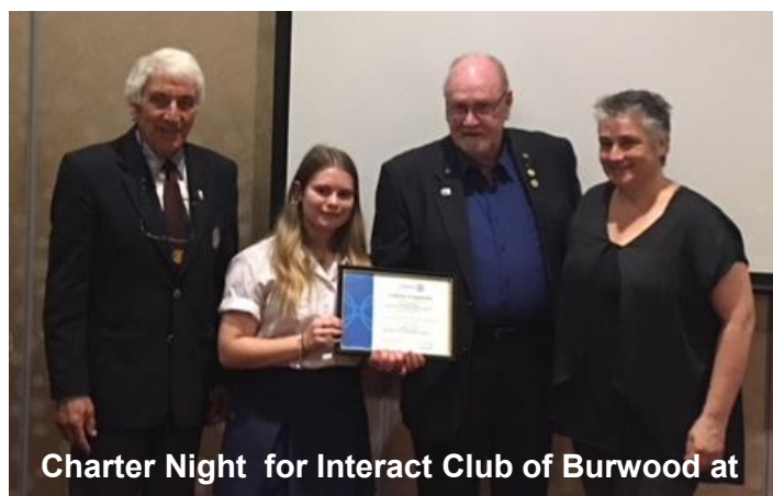
Charter Night for Interact Club of Burwood at