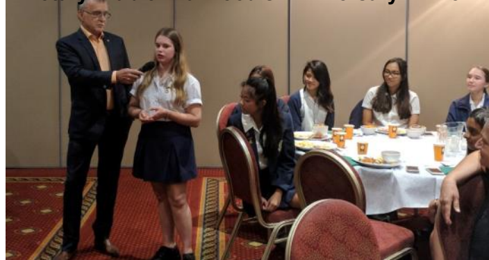
Rotary Club of Burwood's Anniversary Dinner

Schools are often microcosms of the community and relationships between Rotary Clubs and schools often provide a rich area for mutual support. A good start is the school principal and thereafter a link to a co-operative member of the school staff.